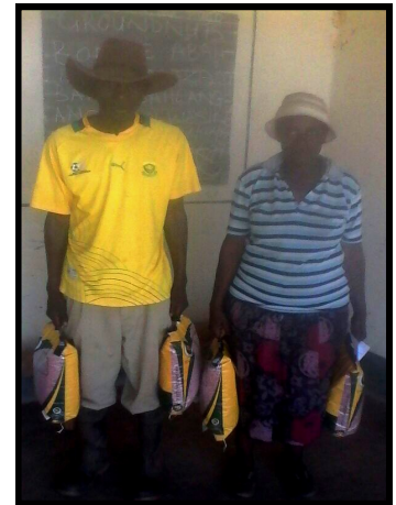
Picture above: Two members of Siwazi irrigation project (Insiza District) received 10kg groundnut seed each for 0.1ha.

Despite the funding challenges the Projects Centre, continues to work with the rural irrigation farmers, to provide extension services and facilitate market linkages. The training program has been temporarily shelved, while efforts are made to raise financial support for farmer training. The cash flow challenges of the Worringham Factory have been solved and the factory is now looking to buy large quantities of groundnuts, butternut, garlic, tomatoes and other produce. The focus is therefore now on encouraging farmers to grow groundnuts during the rainy season for the production of peanut butter. One Tonne groundnut seed is currently being distributed to farmers at Siwazi and Silalabuhwa irrigation projects. For every kg of seed issued the farmer is to return 2kg.