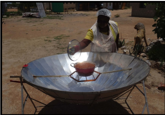
Pictures below: Solar cooker demonstration at the Cowdray Park Centre.