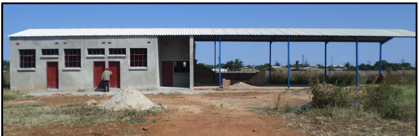
Picture below: About half of the Business Incubation Centre in Nketa suburb has been completed and is ready for use.