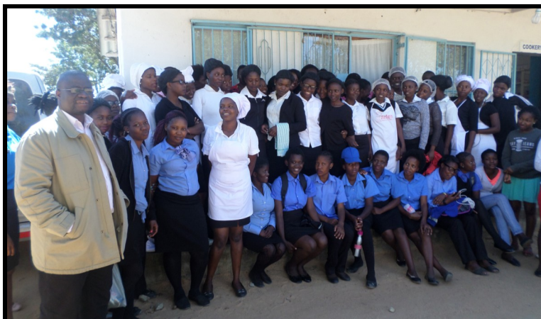
Picture left: The first group of young girls during their training at Thorngrove Centre.

placements under both formal and informal apprenticeships. The training is fully paid by Dot Youth. This training aims at reducing Bulawayo's young women's poverty through market-driven vocational training, skills development and linkages to prospect employment opportunities through a post-training work-readiness and exposure program. Courses currently offered are hotel and catering, hairdressing, motor mechanics and event management. The agreement runs up to October 2017.